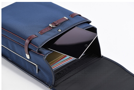
■ Tablet PC Pocket