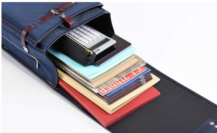
■ Large capacity