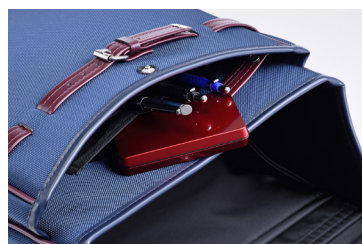
■ Pen Pocket & Card Case holder